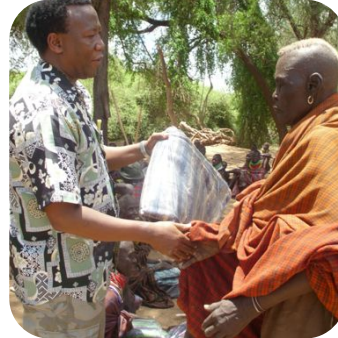
We sent blankets, oil, maize and porridge