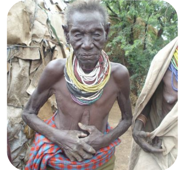
The elderly have been badly affected

You will know from the news that the famine in Kenya, Sudan and Somalia is pretty desperate. The main aid agencies are active in the camps, which are unsafe and politically difficult.